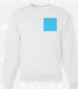
LEFT CHEST MAX AREA: 5" x 5"