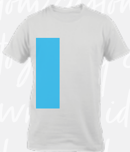
RIGHT VERTICAL MAX AREA: 5" x 14"