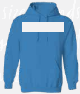
ACROSS SHOULDERS MAX AREA: 4" x 14"