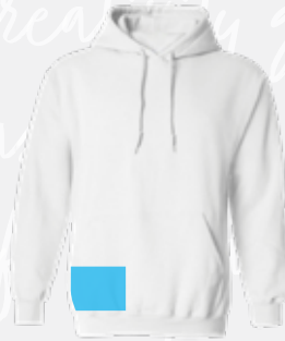
FRONT BOTTOM RIGHT MAX AREA: 5" x 6"