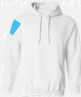
RIGHT SLEEVE MAX AREA: 3.5" x 3.5"