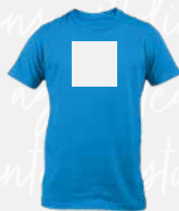
LOCKER PATCH AREA MAX AREA: 4" x 4"