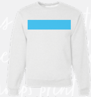
ACROSS CHEST MAX AREA: 4" x 12"