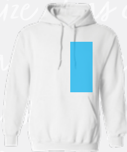
LEFT VERTICAL MAX AREA: 5" x 14"