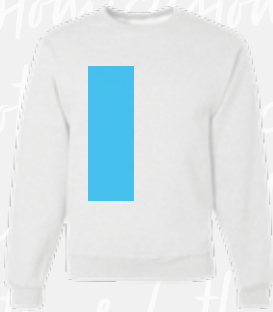
RIGHT VERTICAL MAX AREA: 5" x 14"