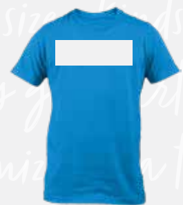
ACROSS SHOULDERS MAX AREA: 4" x 14"