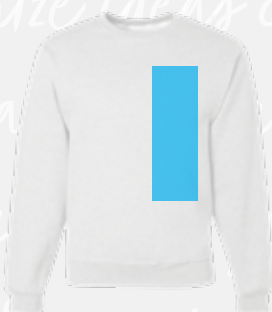
LEFT VERTICAL MAX AREA: 5" x 14"