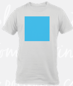
MEDIUM FRONT MAX AREA: 8" x 8"