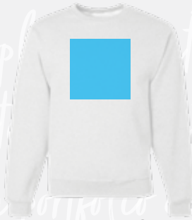
MEDIUM FRONT MAX AREA: 8" x 8"