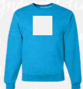
LOCKER PATCH AREA MAX AREA: 4" x 4"