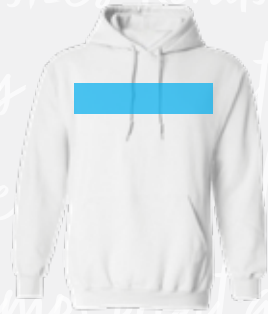
ACROSS CHEST MAX AREA: 4" x 12"