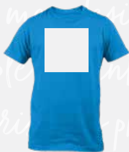
MEDIUM BACK MAX AREA: 8" x 8"