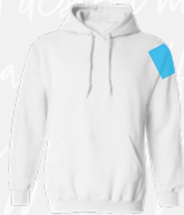
LEFT SLEEVE MAX AREA: 3.5" x 3.5"