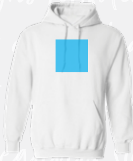
CENTER CHEST MAX AREA: 5" x 5"