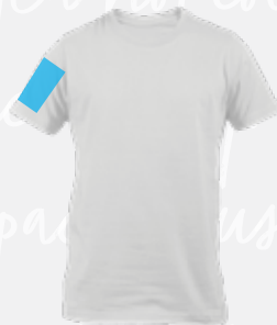
RIGHT SLEEVE MAX AREA: 3.5" x 3.5"