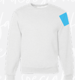
LEFT SLEEVE MAX AREA: 3.5" x 3.5"