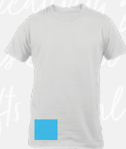
FRONT BOTTOM RIGHT MAX AREA: 5" x 6"