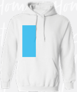
RIGHT VERTICAL MAX AREA: 5" x 14"