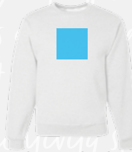
CENTER CHEST MAX AREA: 5" x 5"