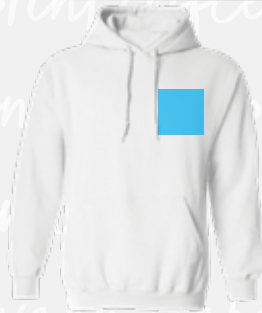
LEFT CHEST MAX AREA: 5" x 5"