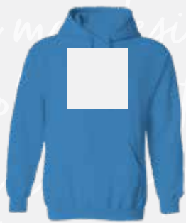
MEDIUM BACK MAX AREA: 8" x 8"