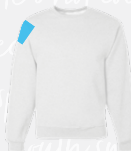
RIGHT SLEEVE MAX AREA: 3.5" x 3.5"