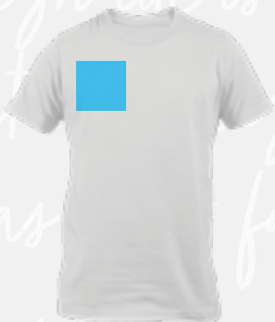
RIGHT CHEST MAX AREA: 5" x 5"