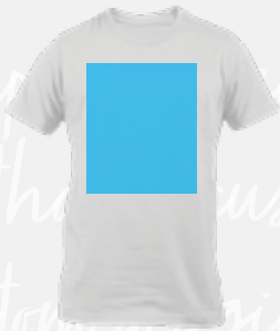
FULL FRONT MAX AREA: 12" x 14"