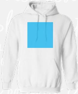
MEDIUM FRONT MAX AREA: 8" x 8"