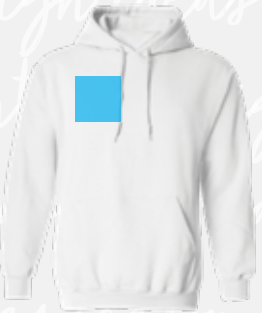
RIGHT CHEST MAX AREA: 5" x 5"