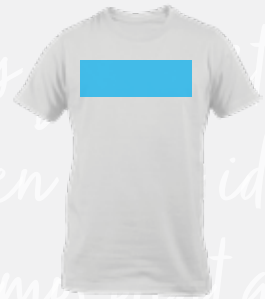
ACROSS CHEST MAX AREA: 4" x 12"