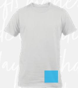
FRONT BOTTOM LEFT MAX AREA: 5" x 6"