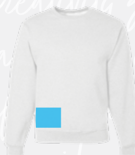
FRONT BOTTOM LEFT MAX AREA: 5" x 6"