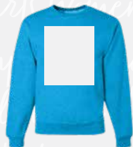
FULL BACK MAX AREA: 12" x 14"