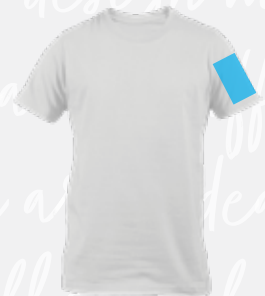
LEFT SLEEVE MAX AREA: 3.5" x 3.5"