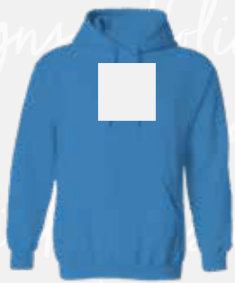
LOCKER PATCH AREA MAX AREA: 4" x 4"