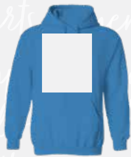
FULL BACK MAX AREA: 12" x 14"