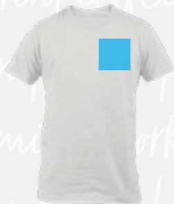
LEFT CHEST MAX AREA: 5" x 5"