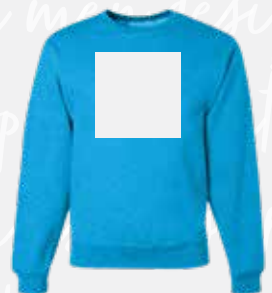
MEDIUM BACK MAX AREA: 8" x 8"