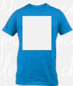
FULL BACK MAX AREA: 12" x 14"