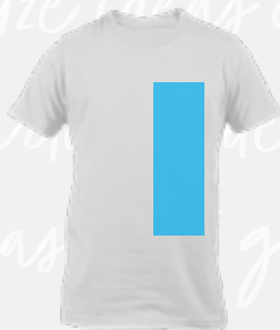
LEFT VERTICAL MAX AREA: 5" x 14"