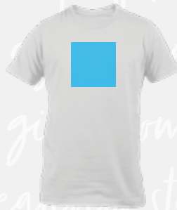
CENTER CHEST MAX AREA: 5" x 5"