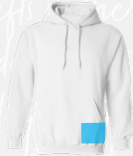
FRONT BOTTOM LEFT MAX AREA: 5" x 6"