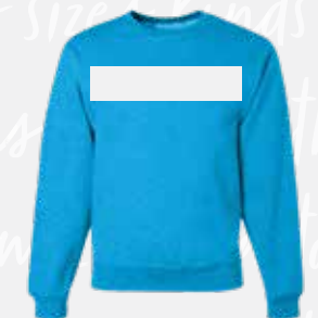
ACROSS SHOULDERS MAX AREA: 4" x 14"